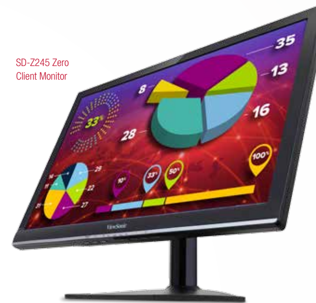
SD-Z245 Zero Client Monitor

► Greater TCO savings: All solid-state design for greater reliability, low power energy savings, easy deployment, and centralized device management software contribute to greater total cost of ownership savings.