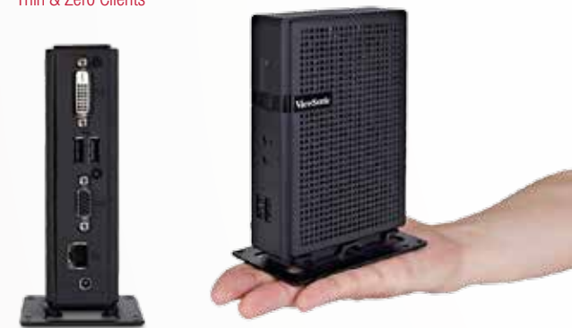
Thin & Zero Clients