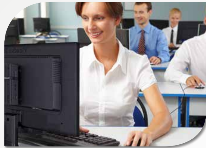
SC-T35 Thin Client

The ViewSonic SC-T35 and SC-T45 thin clients are the perfect choice for either Citrix® XenDesktop® or Microsoft® VDI implementations. ViewSonic thin clients are ideal endpoint solutions for providing desktop virtualization in conjunction with existing infrastructures—they can be mounted to any VESA-ready monitor. In addition, the SC-T35 and SC-T45 support professional graphics applications and deliver a multimedia rich virtual desktop, with excellent 2D/3D graphics.