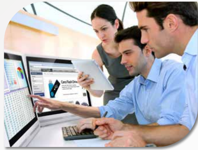
Smart Display Clients

Leveraging its 25-year heritage as a desktop technology leader, ViewSonic delivers a full line of thin, zero, and smart clients to help organizations transform their IT resources into a cloud computing infrastructure. Whether running a VMware®, Citrix®, or Microsoft® virtualization initiative, you can quickly and easily deploy virtual desktops across your entire enterprise with ViewSonic's complete range of VDI clients.