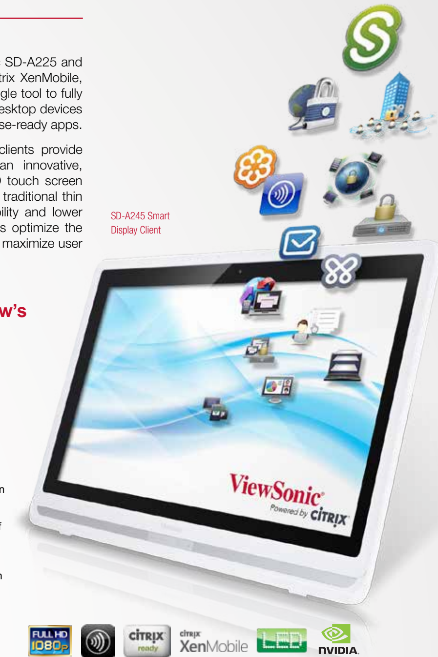
SD-A245 Smart Display Client

► Advanced VDI desktop client: All with a single device, an IT organization can deliver legacy Windows apps and virtual Windows PC desktops for business continuity in the post-PC era. As the needs of an organization grow, additional Citrix technology and services can easily be integrated and deployed.