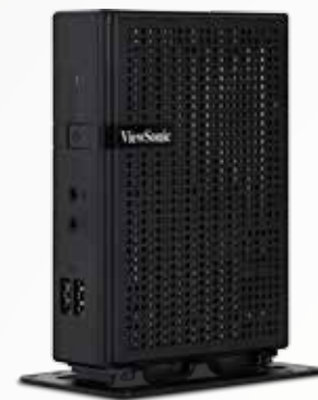
Dual Port 2.0 USB ports